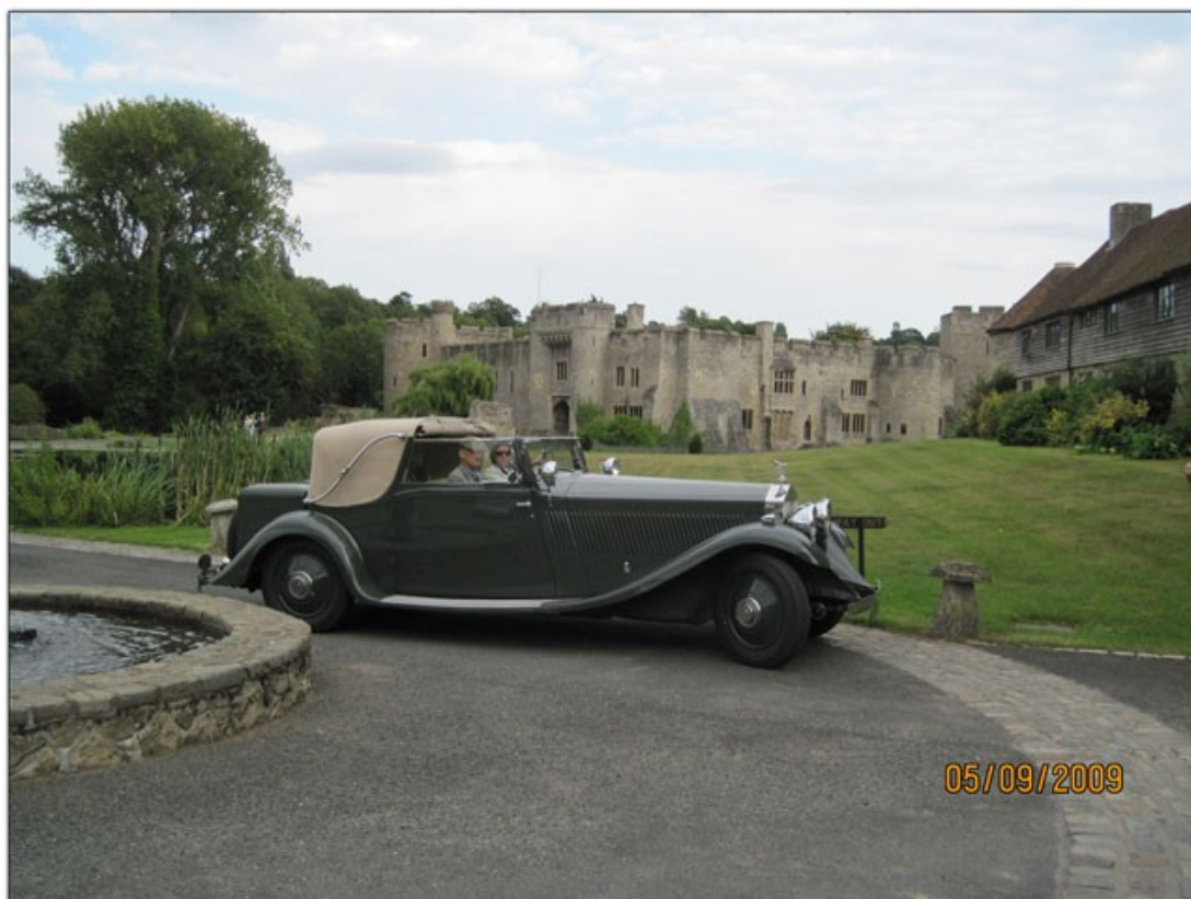
Phantom II Continental 80 MY 1933 Barker Sedan coupé

För frågor och info kontakta Olle Ljungström 0733-89 45 10 ol@minmail.net